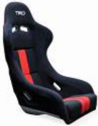
3. Full Bucket Seat