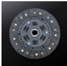
7. Clutch Disc (Sports Facing)