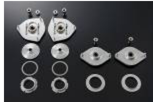
11. Pillo-ball Upper Mount Set