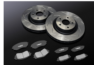
9. Circuit Brake Kit