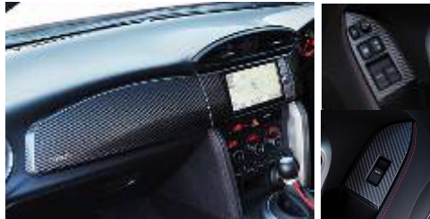
4. Interior Panel Set