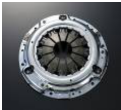
6. Clutch Cover