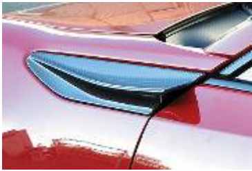
1. Front Fender Aero Fin