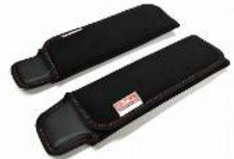
5. Seat Belt Shoulder Pad Set