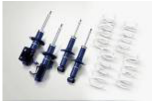
10. TRD Sportivo Suspension Set