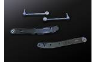
14. Lateral Link Set