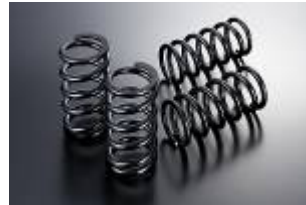
12. Coil Spring