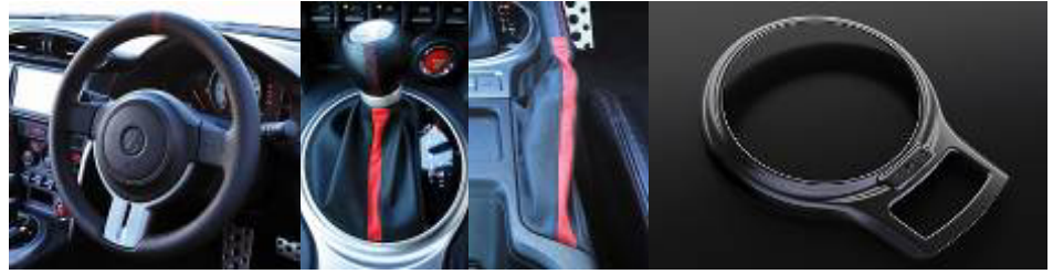
2. Steering wheel & Interior Boot Set (Photo is for AT model)